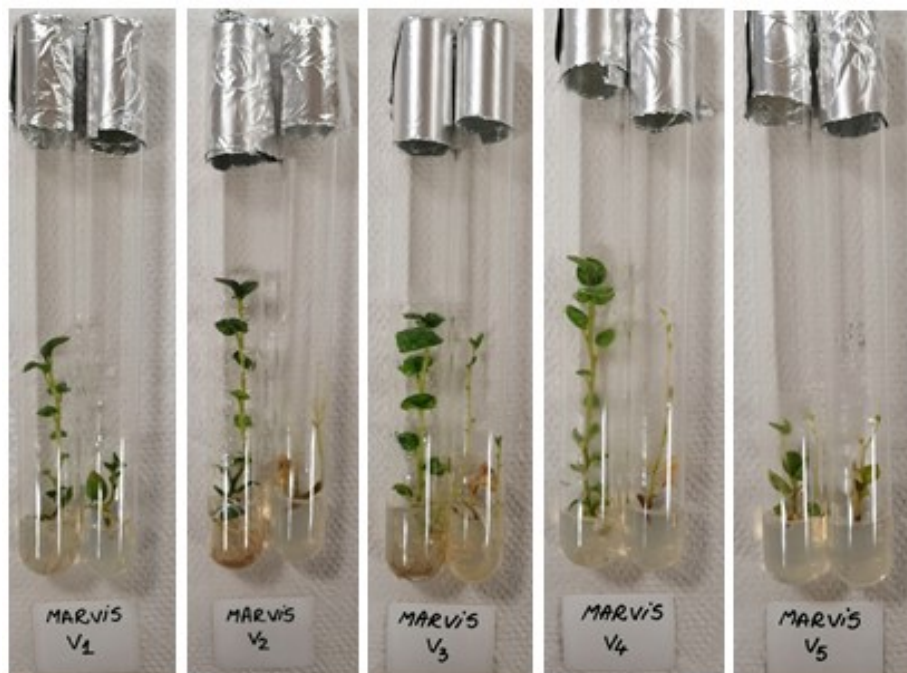
Figure 1. Microplants regenerated from young explants (left) and aged explants (right), 1 month after inoculation of explants (Marvis variety)

(more and longer roots) compared to the plantlets regenerated from aged explants (Figure 1). The measurements made in this study regarding: shoot and root length, leaves and nodes number, rooting efficiency and leaf size, and the results were achieved on the plantlets obtained from young explants.