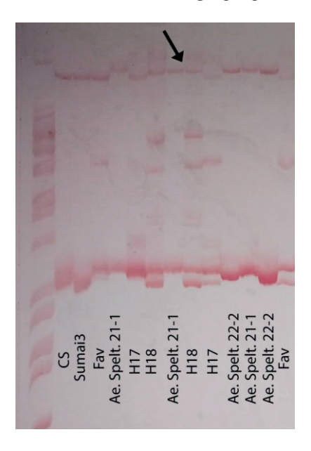
Figure 2. Electrophoretic patterns obtained with functional marker TaS1 H17 = G557-2; H18= G557-6 [The arrow shows the similar DNA band between G557-6 and Ae. speltoides. ]

It is interesting to note that Awlachew et al. (2016) also identified in Triticum durum progenies from crosses with Ae. speltoides , QTLs for chlorophyll and stay-green under heat QTLs chromosome 2B, contributed by Ae. speltoides .