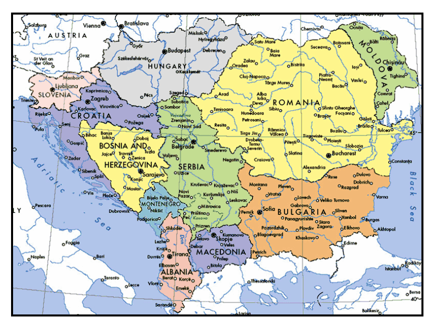
Figure 1. Map of the South Eastern Europe, the region where the collecting expeditions were conducted

The region of South Eastern Europe and the countries where the collecting expeditions were carried out is presented on the map in figure 1.