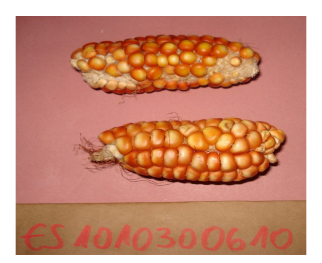
Figure 4. Local landrace from southern part of Macedonia, drought resistant, grown without irrigation

The population which had been cultivated for years, usually without irrigation, was reported to have very good drought resistance (Figure 4).